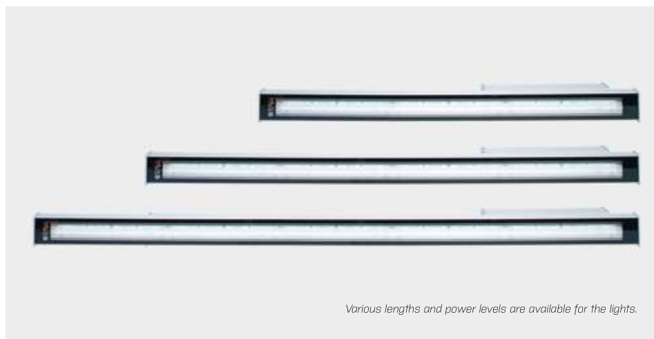
Various lengths and power levels are available for the lights.

A specially designed aluminium body and the overall design of the luminaire ensures efficient heat conduction during the warm summer months. LED chips and electronic lights operate in comfortable temperature conditions, even under ambient temperatures exceeding 40°C.