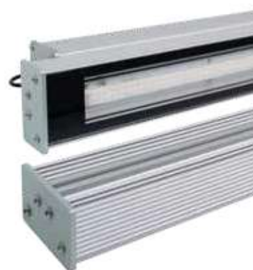
A specially designed aluminium body ensures efficient heat conduction during the warm summer months. On the contrary, a unique front-screen heating system is automatically activated if the luminaire is covered by ice, frost or snow.