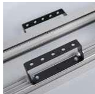
An adaptive holder for various fixation spans based on the client's specifications is included.