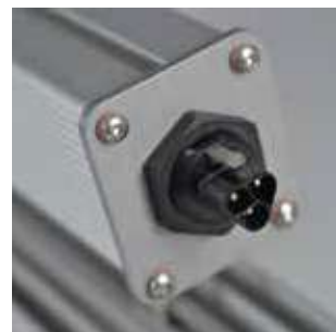
The IP68 rating connector ensures a simple connection. At the request of the customer, it can be replaced with a custom solution.