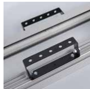
An adaptive holder for various fixation spans based on the client's specifications is included.