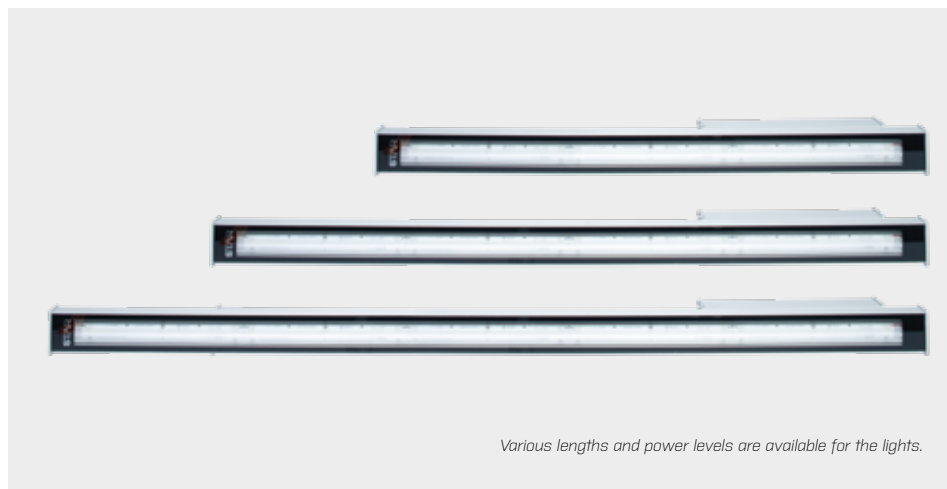
Various lengths and power levels are available for the lights.

A specially designed aluminium body and the overall design of the luminaire ensures efficient heat conduction during the warm summer months. LED chips and electronic lights operate in comfortable temperature conditions, even under ambient temperatures exceeding 40°C.