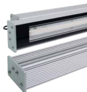
A specially designed aluminium body ensures efficient heat conduction during the warm summer months. On the contrary, a unique front-screen heating system is automatically activated if the luminaire is covered by ice, frost or snow.