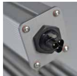
The IP68 rating connector ensures a simple connection. At the request of the customer, it can be replaced with a custom solution.